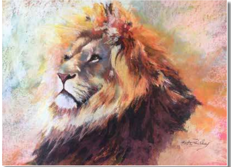
Hettie Rowley "Glory Days": Lovely layering of colour, captures the power of the beast.