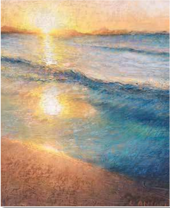
Lynette Ansari "Sunset Byron Bay": Textured under-painting gives wonderful depth and expression.