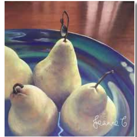
3 rd Jeanne Cotter

Excellent composition and use of negative space, incredibly precise and detailed application.