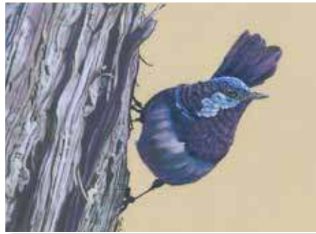
2 nd Angela Parr

Eye catching exploration of the pandanus structure.