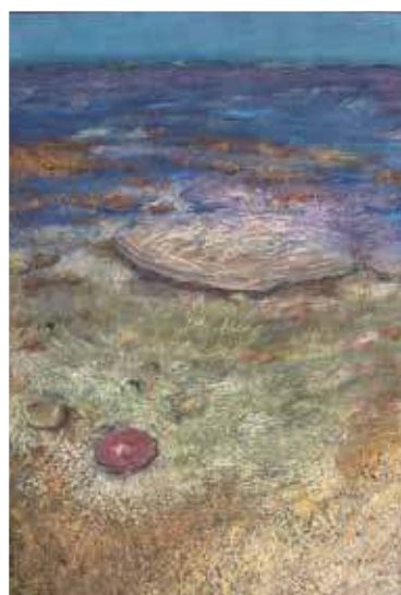
2 nd Lynette Ansari

Dynamic image, great mark-making and aerial perspective and feel for the resting water.