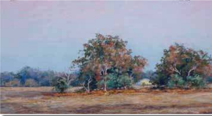
Rachel Cant "Afternoon Whispers": Captures the Australian landscape at day's end.