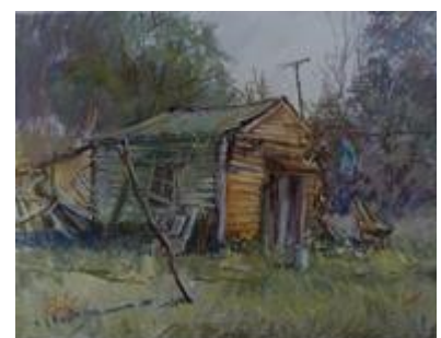
Old Shed - Plein Air Painting

For further enquiries please contact : Betty Sutton Ph: 0417 672 771