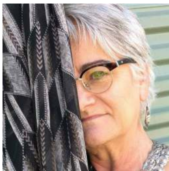
Zoom Meeting 8th March 2022.