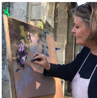
Zoom Meeting 8th February 2022.